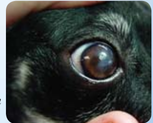
Four weeks after application of Tissumend II Sterile