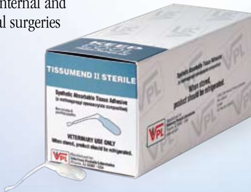
Tissumend II Sterile in 1.2 ml prefilled pipettes, 6 pipettes per box. Store under refrigeration