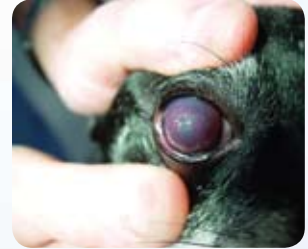
Deep eroding ulcer with neovascularization in a 3 year old male Chihuahua