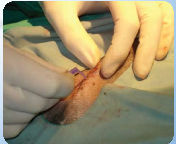
Tissumend II being applied to close canine castration site