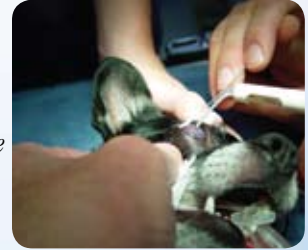
After debridement to remove the nonadherent edges, Tissumend II Sterile was applied to the ulcer